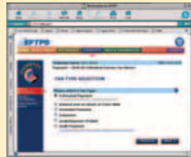
make a tax payment page

The money will move from your bank account to Treasury's account on the date(s) you indicate. IRS only receives the tax payment information to update your tax records. IRS does not have access to your financial institution account information.