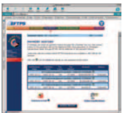
individual payment history page

With EFTPS-OnLine, you can logon and check all EFTPS payments you have made in the last 120 days*. Your payment history contains the type of payment, when it was made, how it was made, how much, when it was received, and when it settled. All this information is available to you online 24 hours a day, 7 days a week.